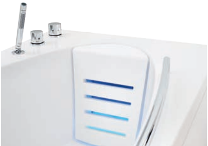
The electrodes and water intake are inconspicuously located behind the backrest and foot panel. The colour LEDs bathe the water in various shades according to the programme selected.