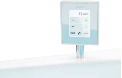
Run the water, select the bathing programme and adjust the strength of the current – all the eVitarium's functions can be set via the touch panel.