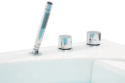
The water temperature is set via the taps. The flexible shower head serves to rinse off and helps with cleaning the tub.