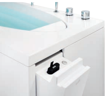
The main switch and battery compartment are integrated into the foot of the bath. After installing the battery and activating the main switch, this operating terminal simply disappears into the body of the tub.