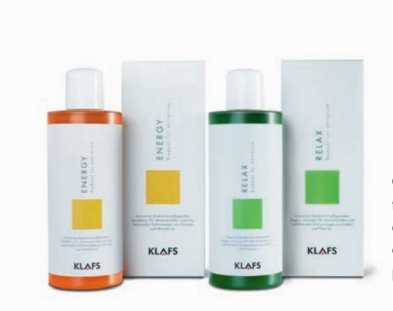
Created by Babor for the KLAFS eVitarium: thanks to ionised components, the ENERGY and RELAX bath oils penetrate particularly deep into the skin and ensure a noticeably pleasant, velvety sensation.

The RELAX bathing oil, based on argan and soya oils, complements the bath programme perfectly. Alongside the beauty benefits for the skin, the aromatic thyme and sage notes have a calming effect on the mucous membranes.